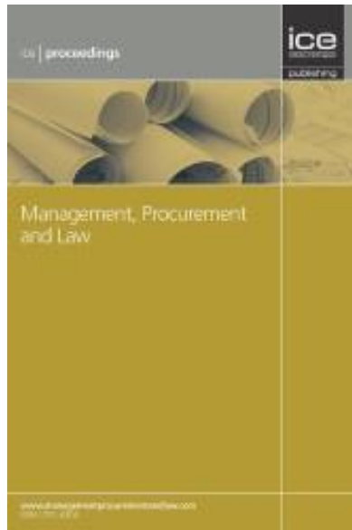
Management, Procurement and Law

ICE Publishing has published the latest Issue of the CIB Encouraged Journal Management, Procurement and Law. The theme of this issue is: Off-site Construction and Design for Manufacture.